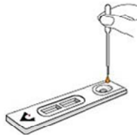
Apply sample to sample well