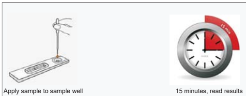
Apply sample to sample well